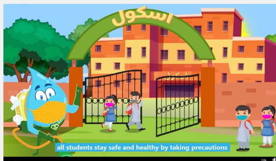
Clean Green Pakistan Encouragement Award 2020