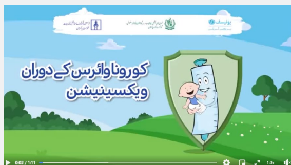
#VaccinesWork: Vaccination during the COVID-19 pandemic